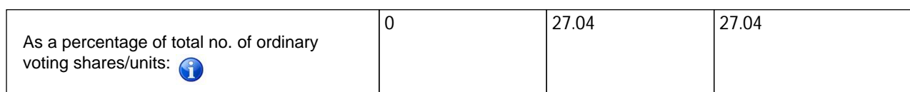
Table 3. Change in respect of rights/options/warrants over shares/units of Listed Issuer