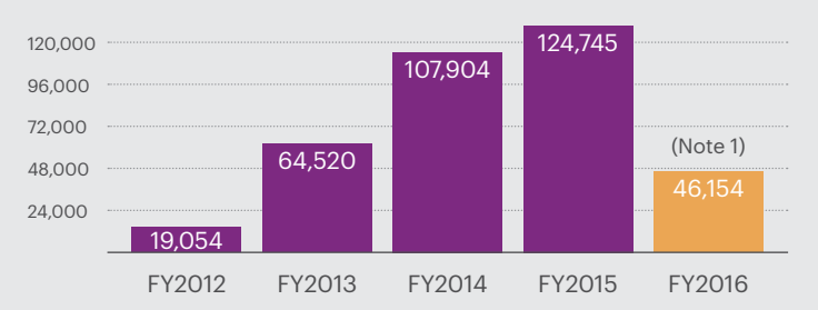
Profit After Tax (RMB '000) RMB16.3 million