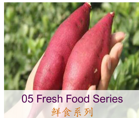
05 Fresh Food Series 鲜食系列